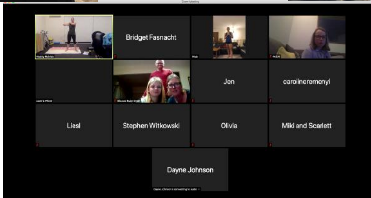
Zoom fitness calls during COVID-19 lockdown